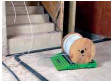
The Easy Roller simplifies the rolling and unrolling of cable drums.

A host of technical solutions is available for cable pulling. These solutions vary greatly depending on the application or cable type. Our range offers solutions for light and heavy duty cables, and for long straight lines, angular channels or hollow spaces.