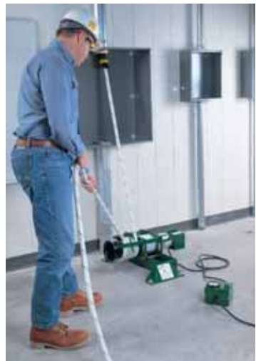
Ultra Tugger™: Use via floor device.